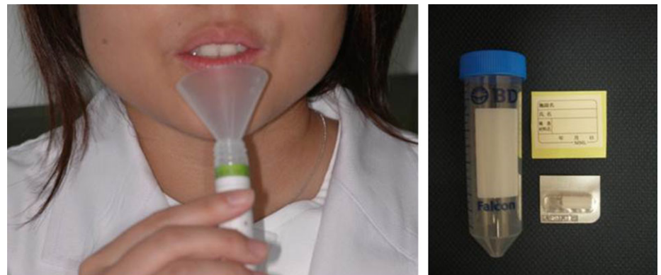
Fig. 1. Sampling of saliva. Patients were required to chew gum for 5 min, after which 3–5 ml saliva was obtained.