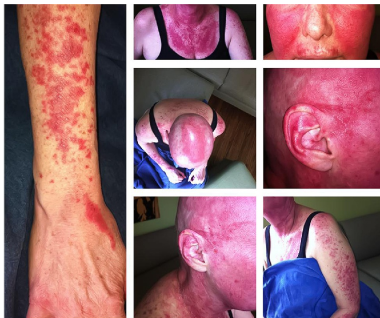
Figure 1 Severe erythematous desquamating rash. The rash involved the forearms, anterior trunk, scalp, cheeks, ears, neck, back, as well as membranes of the nose and vagina resulting in epistaxis and vaginal bleeding.

Drug-induced SCLE is an uncommon cutaneous reaction associated with chemotherapy use. In the case presented, given the temporal relationship of the patient's dermatological toxicities to her chemotherapy treatment, we postulate that the taxane docetaxel is the most likely culprit. In the current literature, there have been eight reported cases of SCLE associated with docetaxel, and five reported cases of SCLE associated with paclitaxel chemotherapy [1-13]. Many of the patients in these cases had a background of preceding autoimmune disease with positive anti-SSA/Ro antibodies [1-5,8,10,11]. It has been suggested that the presence of serum anti-SSA/Ro antibodies