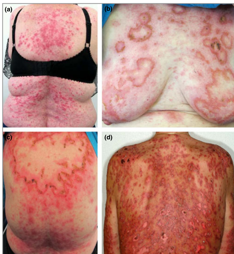
Fig 2. Illustrations of three patients with proton pump inhibitor-induced subacute cutaneous lupus erythematosus. (a) Papulosquamous subacute cutaneous lupus erythematosus in patient number 2; (b,c) annular and polycyclic subacute cutaneous lupus erythematosus in patient number 5; and (d) targetoid lesions in patient number 8.

A literature review of PPI-induced CLE using the PubMed online database identified 18 case reports of PPI-induced SCLE and one case of PPI-induced DILE. 5,12,15–23 However, the latter case did not fulfil the proposed definition of DILE, as the discoid lesions occurred after discontinuation of pantoprazole. In a Swedish case–control study of 234 patients with SCLE, 65 had received PPIs. 10 A significant odds ratio of 2.9 for prescription of PPIs in the 6 months preceding a diagnosis of SCLE was reported.