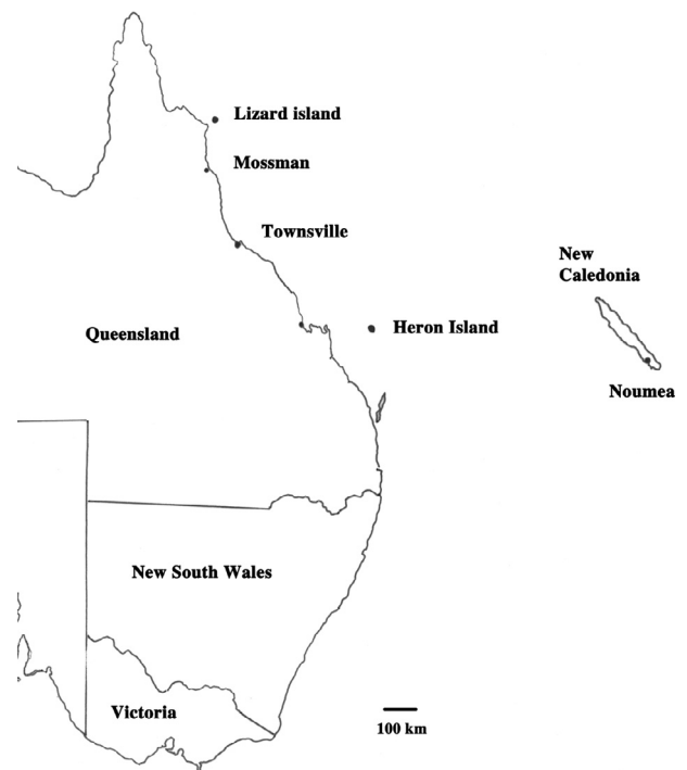
Figure 1. Collection localities off the east coast of Australia and New Caledonia.

Metacestodes were collected mainly from body cavities of teleosts, although in some instances they were sought in regions of the body such as the gill arches and musculature. Metacestodes were removed from surrounding cysts (in the case of plerocerci) and the eversion of tentacles was achieved either by shaking vigorously or by applying pressure under a coverslip. Cestodes were fixed in 70% ethanol or 10% formalin and were stained with Celestine blue or carmine (Palm, 2004) [27], dehydrated in ethanol, cleared in methyl salicylate and mounted in Canada balsam. All specimens were identified by IB and have been deposited in either the British Museum