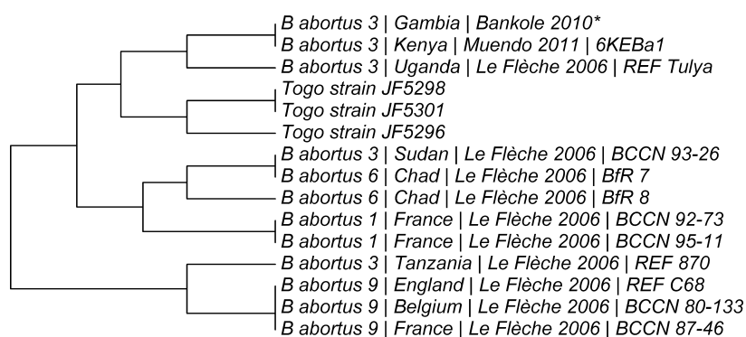
FIG. 2. Dendrogram showing the genetically closest strains to the three Togo strains. The species and biovar are given, followed by the country in which the strain was isolated, the author and the strain reference from the MLVA-net. This analysis was performed using MLVA-8 (panel 1) loci plus bruce18 and bruce21, in order to assess large-scale population structure. *This strain is not listed in MLVA-net [14].

border trade in Togo [15], livestock movements are likely to play a role in this genetic diversity.