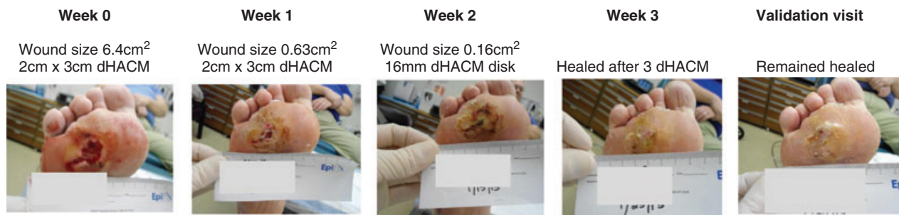
Figure 2 Male, 54 years of age with 6.4 cm 2 plantar ulcer of 48 weeks duration. Randomised to receive weekly dehydrated human amnion/chorion membrane (dHACM) application. Complete healing occurred after three applications of dHACM. Wound reduced in size by 90.1% after first dHACM application.