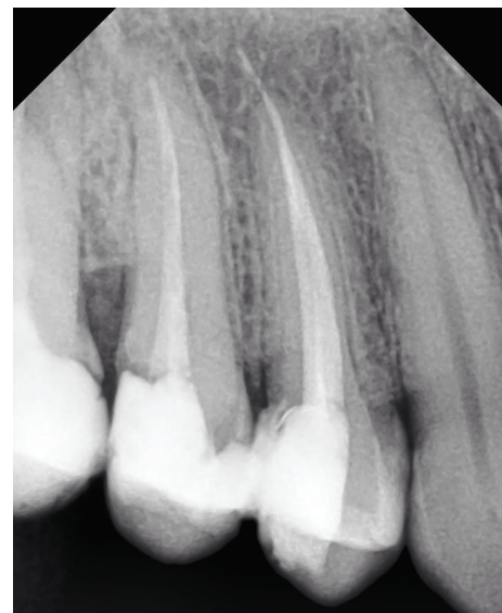
FIGURE 2: One root with two canals shared one apical foramen.