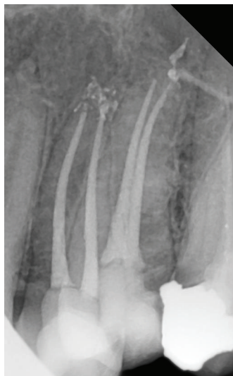
FIGURE 3: One root with two canals and two separate apical foramina.