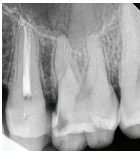
FIGURE 4: Two roots with two separate canals.

Maxillary second premolar root canal system demonstrates high variability and it was the only tooth to demonstrate all eight Vertucci's canal configurations [6].