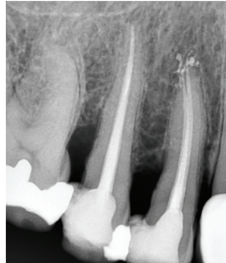
FIGURE 1: One root and one root canal.

Out of the 117 males 47.9% of the maxillary second premolar had one root, 51.2% had two roots, and 0.8% had three roots. Regarding root canal morphology 12% of the male maxillary second premolars had type I, 19% had type II, 68% had type IV, and 0.8% had type VIII.