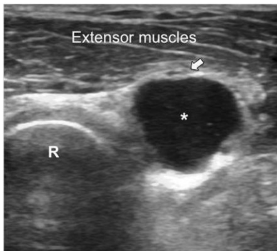
Fig. 1 US imaging (axial view) shows an anechoic (ganglion), lobulated cyst (asterisk) compressing the posterior interosseous nerve (white arrow) distal to its branching from the radial nerve at the level of the radial head (R)