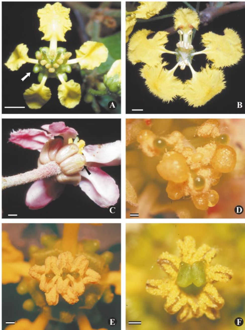
FIG. 1. (A–F) Flowers of Mascagnia sepium and Banisteriopsis lutea showing the different flag petals, and the presence (A) or lack (B) of elaiophores (arrow). Scale bars = 2.5 mm. (C) Elaiophores of M. cordifolia with oil accumulated under the transparent cuticle (arrow). Scale bar = 1.0 mm. Arrangements of styles/stigmas and stamens in flowers of (D) B. adenopoda , (E) Tetrapteryx guilleminiana , and (F) Dicella bracteosa . Scale bars = 5.0 mm.

broken but its rupture needs mechanical factors, usually floral visitors, and mainly pollinators (Fig. 2D). The stigmas of flowers isolated in waterproof bags displayed intact cuticles and no pollen (Fig. 2C). Malpighiaceae species have a special type of ‘wet’ stigma (cf. Heslop-Harrison and Shivanna, 1977; Heslop-Harrison, 2000), a feature already reported for many Leguminosae (Heslop-Harrison and Heslop-Harrison, 1983; Lord and Heslop-Harrison, 1984).