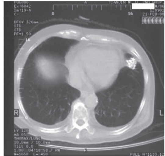
Figure 5. Left pulmonary metastases reduced by >50% following 125 I brachytherapy for six months.