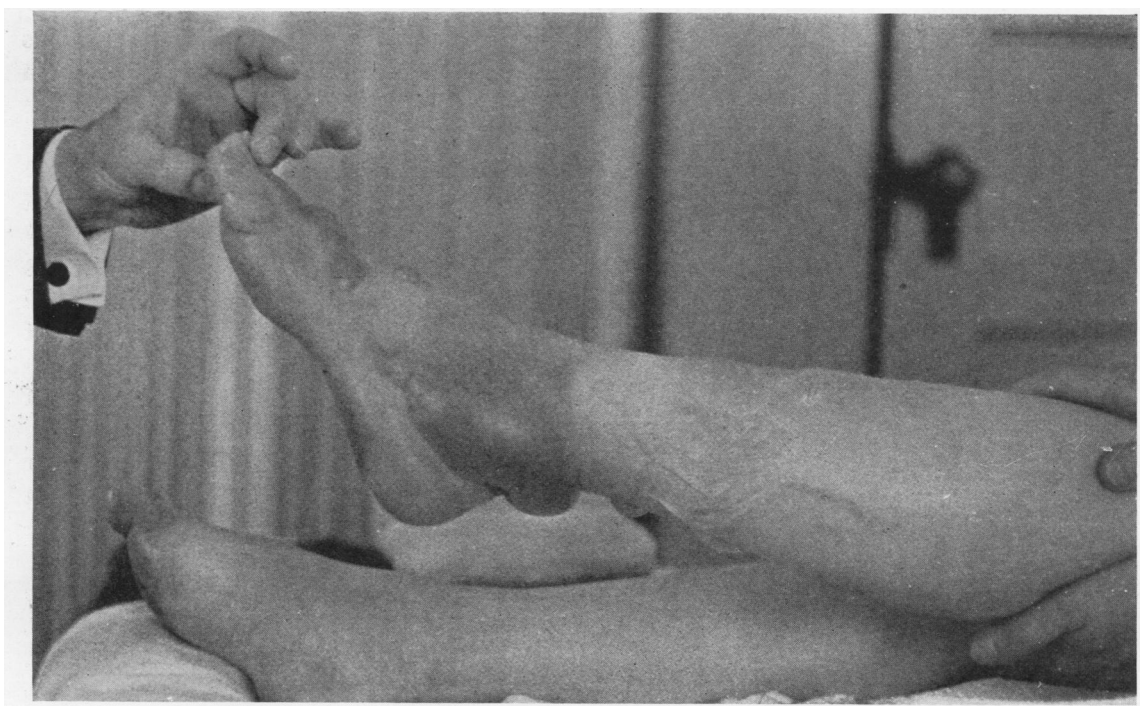
Fig. 2. Blisters and Swelling of Legs Existing 36 Hours after Freezing Both legs were swollen but only the blisters on the left side are well visualized, and the largest of these ruptured before the picture was taken.

extremity, hemorrhage, plasmapheresis, and intestinal manipulation, the bleeding volume was greatly reduced, averaging 21.8 per cent, and in burns the latter author found it to average 20.3 per cent. In another series of experimental burns it was found that in 6 burned animals in which the blood pressure was allowed to fall near a so-called shock level (50 to 82 mm. Hg) before the bleeding volume was determined, the bleeding volume averaged 26.3 per cent. If, however, the bleeding was done before the blood pressure had fallen markedly (102 to 130 mm. Hg), the bleeding volume was already markedly reduced, averaging 31.4 per cent.