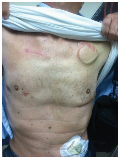
Figure 2 Complete sternal-sparing HeartWare ventricular assist device implantation. A second intercostal incision is utilized to create a surgical window to gain access to the aorta and perform a complete sternal-sparing outflow graft anastomosis.

observed that an additional benefit of this method is adenosine-mediated pulmonary vasodilatation, which may reduce pulmonary pressures and protect the RV function (16,17). Lastly, adenosine has an extremely limited half-life which minimizes the duration and potential deleterious hemodynamic effects of asystole induction (18,19).