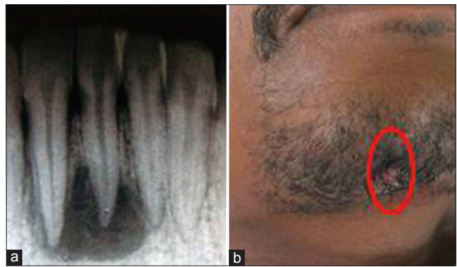
Figure 1: (a and b) The initial presenting symptoms of the patient namely an extra-oral sinus associated with periapical radiolucency with lower central incisors

Long-term use of antibiotics, (at times even anti-tubercular therapy) may make these organisms more resistant to conventional endodontics, hence selection of a suitable ICM must be done with care. In this study, local application of ICM of the mixture of antibiotics was implemented. Metronidazole was selected as the first choice drug as it is selectively toxic to anaerobic microorganisms and can penetrate deep within dentin. Ciprofloxacin exhibits very potent activity against Gram-negative bacteria, but very limited activity against Gram-positive bacteria. Tetracyclines were excluded from the preparation as antibiotic susceptibility isolated enterococcus