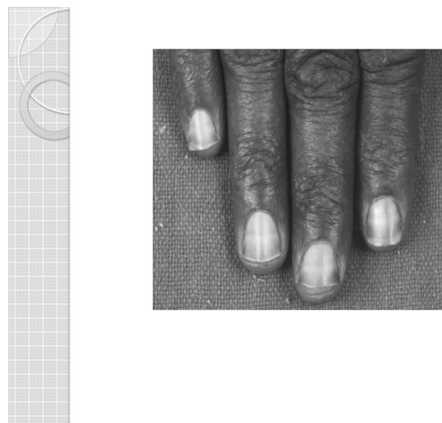
Fig. 3 Mee's lines over nails