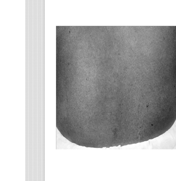
Fig. 2 Raindrop pigmentation of the skin (back)

A 20-year-old male presented to us with weakness of both lower limbs followed by that of upper limbs for 2 months. He was detected with type I diabetes 2 years ago and was controlled with insulin. On the advice of an ayurvedic practitioner, he discontinued the use of insulin and began treatment with