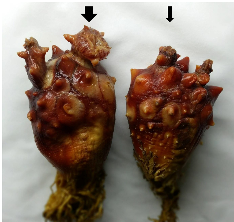
Figure 3 Swelling (large arrow) and normal (small arrow) of the branchial and atrial siphons of Halocynthia roretzi caused by A. hoyamushi infection.

the first stage of invasion [13]. This explains the considerably higher infection intensity in the siphons compared with that in the other parts of the tunic during the early phase of infection (KS-1). In addition, it is believed that the siphons are most suited for A. hoyamushi detection because of the presence of high infection intensity.