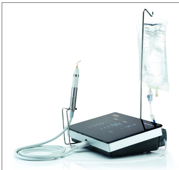
[Table/Fig-1]: The Equipment (Courtesy: Mectron Dental- India Pvt Ltd)

The instruments used for ultrasonic cutting of bone create microvibrations which are the result of a piezoelectric effect, was