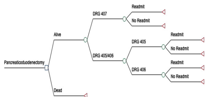
Figure 1 Decision analytic tree demonstrating elements of the cost-effectiveness model constructed, including centre volume, peri-operative mortality, patient-specific diagnosis-related group (DRG), readmission rate and overall cost. A (DRG) code of 405 denotes a patient with a major comorbidity or complication, 406 denotes a patient with a minor comorbidity or complication, and 407 denotes a patient without comorbidity or complication

Parametric variables were compared across quintiles with analysis of variance (ANOVA) whereas non-parametric variables were compared across quintiles with Pearson's chi-square tests. All statistical analyses were performed using SAS Statistical software 9.3