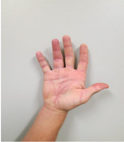
FIGURE 1: Initial presentation of injury. Three weeks after a barb fish spine penetrated the volar aspect of the proximal portion of his ring finger on his right hand. The injury occurred while fishing along one of the Charleston charters in August. He complained of a gradual increase in pain and swelling of the finger. On physical examination, entry and exit points were noted on the affected finger. Marked swelling was present; however, no bruising, cellulitis, discharge, erythema, or induration was noted. He was able to extend and flex the finger.

to the adjacent fingers and lower hand, and an inability to completely flex and extend the affected digits. He denied any fevers, chills, or night sweats. On physical examination, vital signs were normal and he was afebrile. His right upper extremity was grossly normal; however, the volar aspect of the proximal phalanx of the right ring finger had two small scars with a slight firmness of the scar. There was extensive swelling, specifically along the base of the ring finger. There was no palpable foreign body, although there was exquisite tenderness over the A1 pulleys of the right fourth and fifth fingers. He was able to make a full fist without difficulty, and the affected fingertips were neurovascularly intact. No bruising, cellulitis, erythema, or induration of the area was noted, and there was no lymphadenopathy within the right upper extremity.