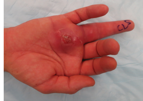
FIGURE 2: Tenosynovitis of the flexor digitorum superficialis (FDS) and flexor digitorum profundus (FDP) tendons. Clear nonpurulent fluid was noted around the tendons. A small puncture area was explored, and no foreign bodies were seen. Tissue samples were sent for pathology and routine acid fast bacilli (AFB) cultures. Due to the high concern for a potential mycobacterial infection, clarithromycin, moxifloxacin, and rifabutin were started empirically. Three days later, he discontinued these medications due to gastrointestinal side effects from rifabutin without informing his physicians. Exudative cultures were negative; however, AFB cultures were positive, consistent with Mycobacterium marinum .

Surgical exploration of the flexor tendon sheath was performed, during which tenosynovitis was noted of the flexor digitorum superficialis (FDS) and flexor digitorum profundus (FDP) tendons (Figure 2). Clear nonpurulent fluid was noted around the tendons. A small puncture area was explored, and no foreign bodies were seen. Tissue samples were sent for pathology and routine acid fast bacilli (AFB) cultures. Due to the high concern for a potential mycobacterial infection, clarithromycin, moxifloxacin, and rifabutin were started empirically. Three days later, he discontinued these medications due to gastrointestinal side effects from rifabutin without informing his physicians. Exudative cultures were negative; however, early on cultures were positive for AFB, which were later confirmed to be M. marinum . Of note, tissue pathology showed fibroconnective tissue with extensive acute and chronic inflammation and Kinyoun