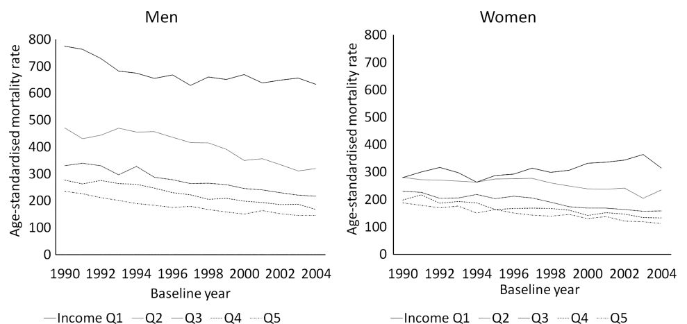
Figure 1 Trends in age-standardised mortality rates by income quintile (Q5 is highest): Swedish men and women aged 30–64 years, 1990–2004. Income data were based on the individual disposable income at a point 3 years prior to death.

mortality do not seem to be fully attributable to the direct effects of the recession. 2 Second, macroeconomic structural reforms to ameliorate the recession may account for the trend observed. Several studies have shown increasing health inequalities or deteriorating health in specific social groups during and