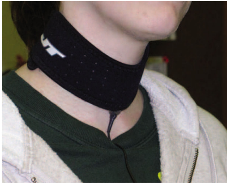
Fig. 2. Swallowing sensor: a miniature throat microphone was glued to a neoprene collar that was fastened to the neck of the subject using flexible velcro. Microphone was located over the laryngopharynx.