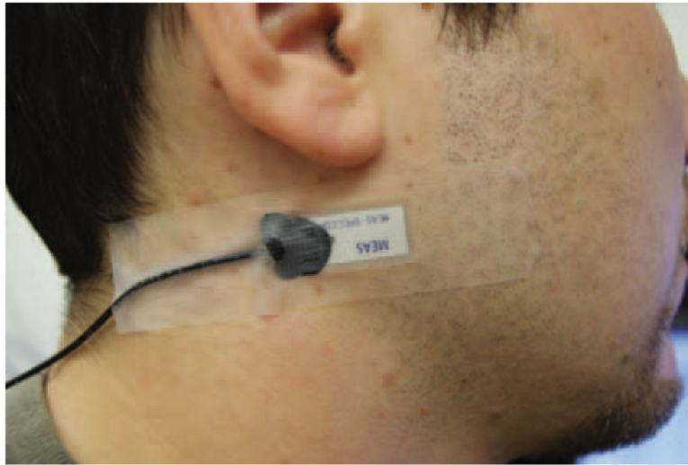
Fig. 1. Chewing sensor: a piezoelectric film strain sensor was attached immediately below the earlobe and above the gonial region of the mandible using medical tape.