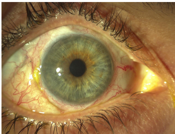
Figure 2 Anterior segment image of the right eye 3 weeks postoperatively. Note: Image demonstrates good position of the scleral patch graft inferotemporally.