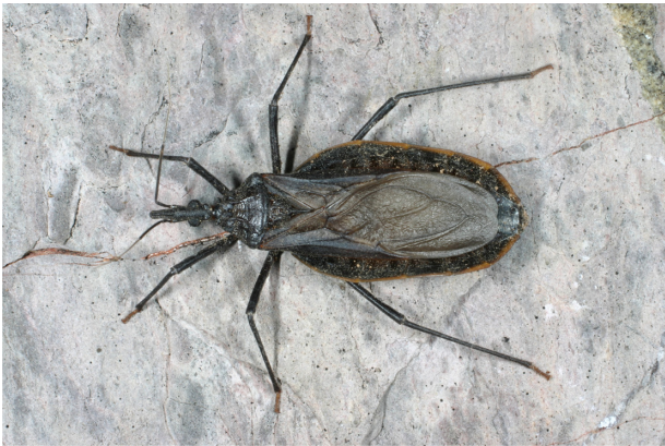
Figure 4. Female Triatoma recurva , the largest kissing bug in the United States.

Kissing bugs are also able to sing , although the purpose of stridulating or sound production is unknown. 19 The long proboscis of kissing bugs terminates at the rostrum, and when the bug is not feeding, it is folded under the prosternum and lays in a recess or stridulitrum. This elegant structure has chitinous, transverse grooves or sulci that form a sort of washboard . Rubbing the rostrum on the stridulitrum gives rise to sound, a barely audible chirping.