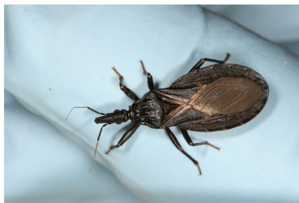
Figure 3. Male Triatoma protracta , another cause of anaphylaxis in California and Arizona.

Aggregation of kissing bugs in hiding refuges appears to be mediated in part by pheromones present in feces 17 and epicuticular hydrocarbons on the bug body. 18 The attraction appears weak and difficult to demonstrate and dependent on the status of individual bugs. Unfed, immature T. infestans were attracted to papers contaminated with feces, whereas recently fed individuals were not attracted. 17 The main attractants in epicuticular lipids are the free fatty acids steric (octadecanoic acid) and, at low concentrations, hexacosanoic acid. At high concentrations, hexacosanoic acid is repellent. 18