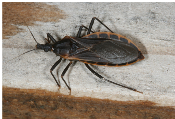
Figure 2. Female Triatoma rubida , a common cause of anaphylaxis in Arizona.

Sexual communication in triatomines remains poorly understood. Sex pheromones are produced in adult metasternal