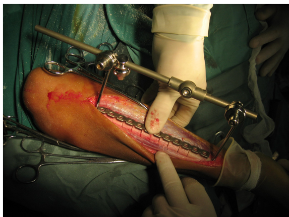
Figure 2 Multiple-level osteotomies of the radius intraoperatively; an external fixator was used for temporary fixation.

The average patient age was 21.3 years (range, 17–24 years) with the most common injury to the right forearm