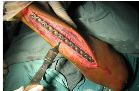
Figure 3 Completed ulnar multiple-level osteotomies.

in 29 patients (96.7%) whose arm became trapped in a machine with moving rollers. The remaining patient was injured while skiing. Twelve patients had a radial or ulnar fracture, 16 patients sustained no fracture, one patient had both radial and ulnar fractures, and one patient had an ipsilateral humeral fracture. Thirteen patients agreed to surgical osteotomy to reset the fracture or the distal/proximal radioulnar dislocation. All patients obtained good forearm function postoperatively with 77° pronation and 78° supination. One patient refused surgical treatment, which led to forearm deformity and dysfunctional rotation (Table 1).