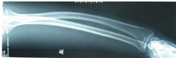
Figure 1 X-ray of both ulnar and radial plastic deformation.

medical records, and all radiographs) for each patient was reviewed by a single orthopedic surgeon (YL) who was not involved in the patients' clinical care. Postoperative forearm rotation was assessed by another senior clinician (TW). Patients' age, injury mechanism, therapeutic process, and forearm rotation function were recorded for further analysis.