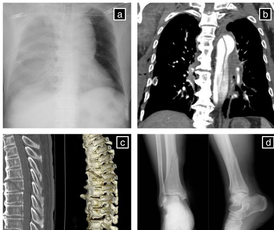
Figure 1 Details of injuries. (a) Chest X-ray showing massive right hemothorax. (b) CT reconstruction showing traumatic aortic dissection. (c) CT reconstruction showing fracture of the eighth and ninth thoracic vertebrae. (d) X-ray showing fracture of the right tibia.

Twenty minutes after arrival, he was transferred to the operating room for the control of bleeding from the right hemithorax. Conservative treatment for the aortic injury included strict blood pressure control, considering the risk of open surgical repair and unavailability of emergency endovascular aortic repair. Exploratory thoracotomy in the right lateral position was performed because of the initial 1,500 mL of blood drainage followed by the persistent bleeding from the right hemithorax. During surgery, the patient demonstrated progressive heat loss despite standard rewarming measures, and his temperature decreased to 32.4°C. Severe acidosis was