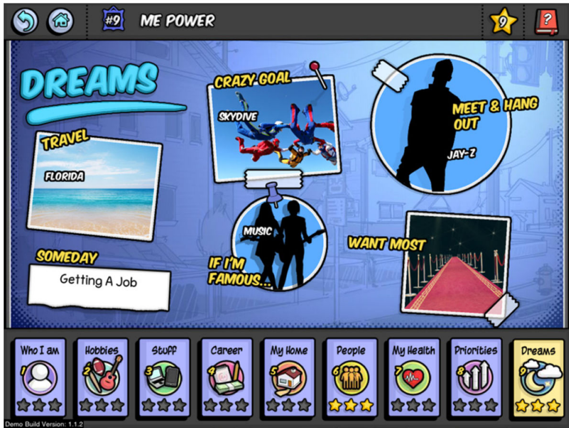
FIGURE 3. Aspirational Avatar Screenshot From PlayForward: Elm City Stories