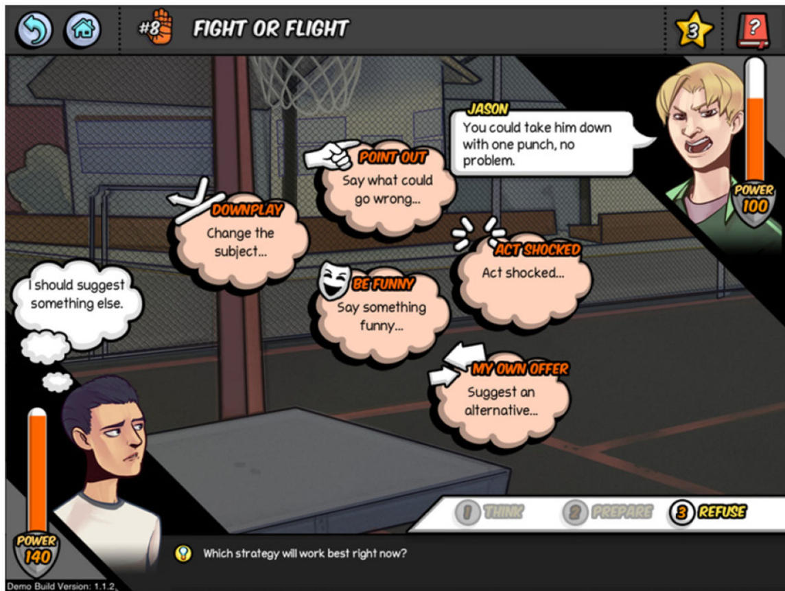
FIGURE 2. Fight Scenario Screenshot From PlayForward: Elm City Stories