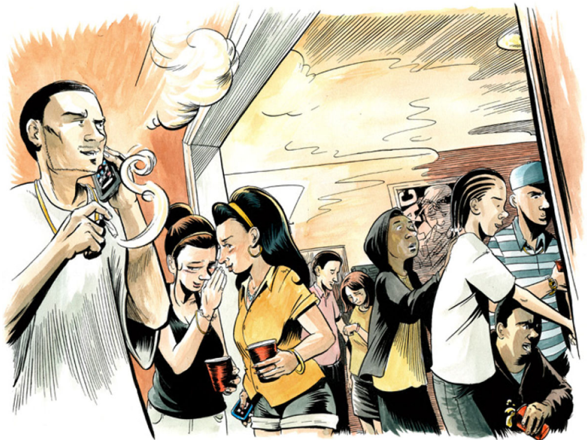
FIGURE 1. Storytelling Using Graphic Illustration