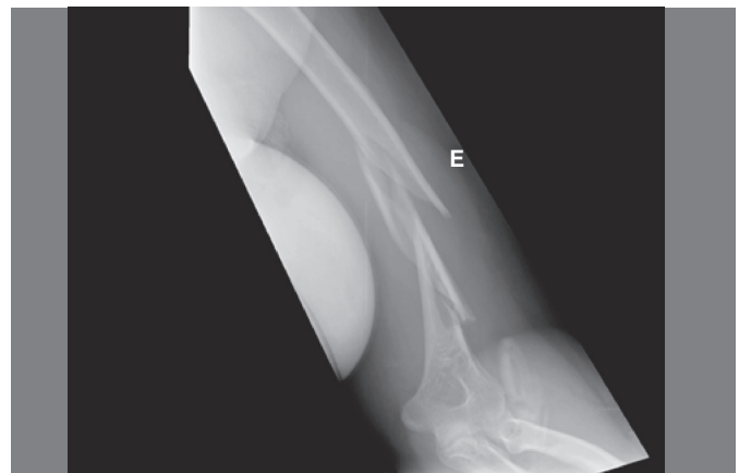
Figure 2. Preoperative X-Ray (AP) of patient with fracture of the distal third of the humeral shaft.