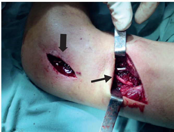
Figure 1. Kocher distal access way (thick arrow) and accessory access way with radial nerve isolated (thin arrow). Note plate below nerve.

The range of motion of the elbow was evaluated by values in degrees recorded in medical records, previously measured with a simple goniometer. For the functional evaluation of the elbow, we used the Mayo Elbow Performance Score (MEPS). 15 Neuropraxia of the radial nerve was assessed by levels of paresthesia and degree of strength (0-5) according to the scale of the British Medical Research Council. We also evaluate the recovery time of the neurological injury. The study was approved by the local Ethics Committee.