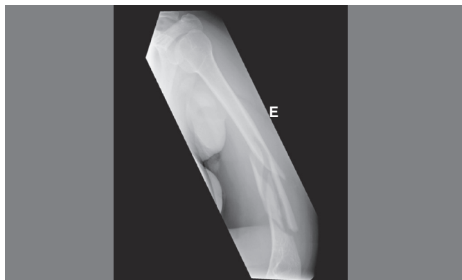
Figure 3. Preoperative X-Ray (Profile) of patient with fracture of the distal third of the humeral shaft.