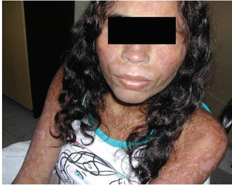
FIGURE 2: Desquamative and nonpruritic lesions in face.