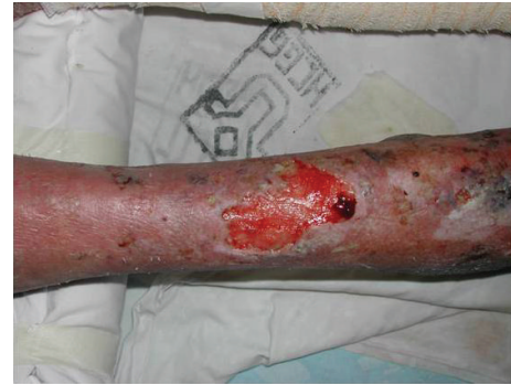
FIGURE 3: Ulcerated lesion with raised borders and sanguinary erythematous background in inferior member.

endoscopy later revealed mucosal lesions with bilateral obstruction by infiltrating lesions. The lesions were biopsied and sent for histopathology and culture for bacteria, mycobacteria, and fungi research.