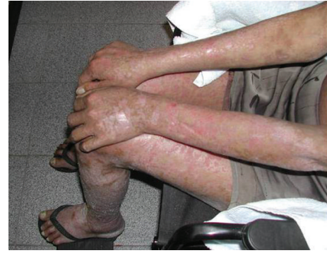
FIGURE 1: Desquamative and nonpruritic lesions in members.

As leishmaniasis/HIV coinfection, HIV infection increases the risk of developing leishmaniasis between 100 and 1000 times, reduces the likelihood of therapeutic response, and greatly increases the risk of relapse [15]. At the same time, leishmaniasis accelerates the clinical course of HIV infection leading to AIDS earlier. Atypical presentations of leishmaniasis may arise by leishmaniasis/HIV coinfection; for example, there are reports of involvement of the viscera with NVL and skin compromise with VL [13]. Intravenous drug users are the main risk group of leishmaniasis/HIV coinfection in European southwest, constituting over 70% of coinfecting patients [11, 13]. In Brazil, drug addicts are only 7% of the coinfecting [14]. Epidemiological data shows that drug addicts are a population at risk, with proved existence of Leishmania parasitemia in asymptomatic blood donors from