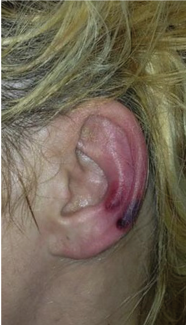
Figure 3. Purpuric patches of the left ear.

emergency department four weeks later after continued cocaine use and autoamputation of the tip of her nose.