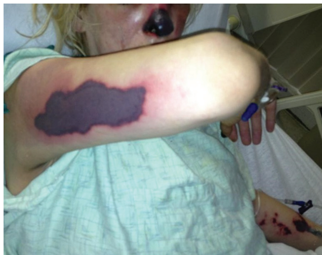
Figure 2. Solid purpuric patch of the lateral right arm, necrotic lesion of the nose, and retiform purpuric patches of the medial left arm.