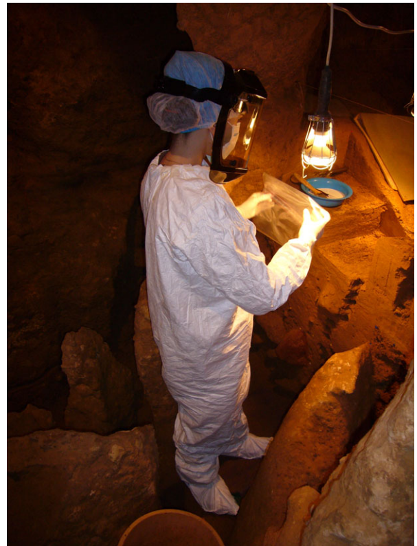
Figure 2. An anti-contamination protocol developed at El Sidrón Neanderthal site in Spain to properly handle ancient samples for DNA analysis. The specimens are excavated with sterile laboratory gear and immediately frozen.

Almost 20 years of Neanderthal palaeogenetics and palaeogenomics have shown us that Neanderthals, an extinct human population, shared a common evolutionary history with modern humans until approximately 0.5 million years ago. Recent studies suggest that after their lineages separated, their demographic trajectories differed: while the Neanderthal population decreased in size for hundreds of thousands of years (as did that of Denisovans), the ancestors of present-day humans stabilized or increased in number [31]. This observation makes sense in the light of what we know about their genetic diversity, which was no more than a third of what has been estimated for modern humans worldwide. In addition, their coding gene patterns show evidence of reduced efficiency of purifying selection and a larger fraction of probably deleterious alleles, particularly at low frequency. Although we are beginning to grasp general patterns of Neanderthal genetic diversity, we cannot completely understand the consequences of their particular demography and population dynamics unless more specimens contemporaneous with each other are analysed. These data will be