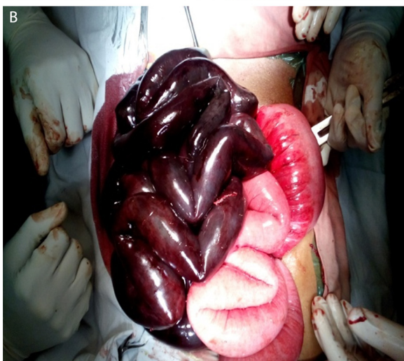
Fig. 2. Intraoperative findings (a) loop of ileum wrapping around dilated sigmoid colon. (b) Gangrenous ileum with dilated sigmoid colon after unwrapping twisted ileum.