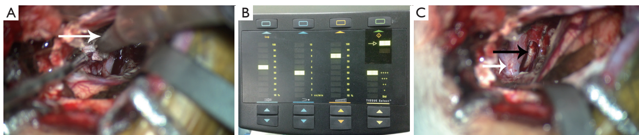
Figure 3 Intraoperative application of the CUSA Excel ultrasonic aspiration system. (A) Intraoperative use of the CUSA Excel ultrasonic aspiration system. The tumor was very close to the ICA (the white arrow indicates the surgical tip); (B) the optimal operating parameters for the use of the CUSA Excel ultrasonic aspiration system when preserving the vessels and nerves; (C) after tumor resection, the ICA (the white arrow) and optical nerve (the black arrow) were protected well. ICA, internal carotid artery.