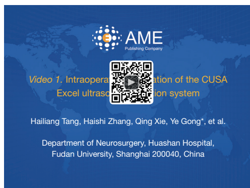
Figure 4 Intraoperative application of the CUSA Excel ultrasonic aspiration system (8). During the operation, the neurosurgeons use the CUSA Excel ultrasonic aspiration system to resect the tumor. After the setup of optimal operating parameters, the brain vessels and nerves could be protected during tumor resection. Our experience is that the optimal parameters for vessel and nerve preservation are as follows: the suction is 60 Hz, the hitting power is 80 Hz, and the paramount of tissue select (++++). Available online: http://www.asvide.com/articles/391

tool during the operation (10,11). We have just introduced a new CUSA Excel in our department, which was produced by Integra Lifesciences Corporation. It could help resect the tumor while protect the vessels and nerves surrounding the tumor during operation if the neurosurgeons choose the optimal operating parameters. This new system was easy to set up and use. The hand piece was not heavy and didn't disturb the view of the neurosurgeon even in keyhole surgical fields (just like the case in our report). We didn't experience any injuries to vessels or nerves during tumor resections.