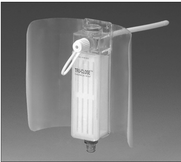
Fig. 1. Thoracic Vent. The extracorporeal dimensions of the thoracic vent are 9 cm (length)×2.5 cm (width)×2 cm (depth). The thoracic vent consists of a flexible 13 Fr urethane catheter with a removable in-line trocar connected to a one-way valve.

mothorax and is usually performed as an inpatient procedure in most institutions, although small-bore catheters have been used in some institutions [1]. In 1991, the first TV that made outpatient drainage therapy possible was reported [2]. A TV is a 10 or 13 Fr thoracic tube with a small extracorporeal box (9×2.5×2 cm) containing a one-way valve. It is useful for draining air, but not fluids because the capacity of the extracorporeal box is only 30 mL. Therefore, a TV is not indicated for pneumothorax with a significant amount of pleural