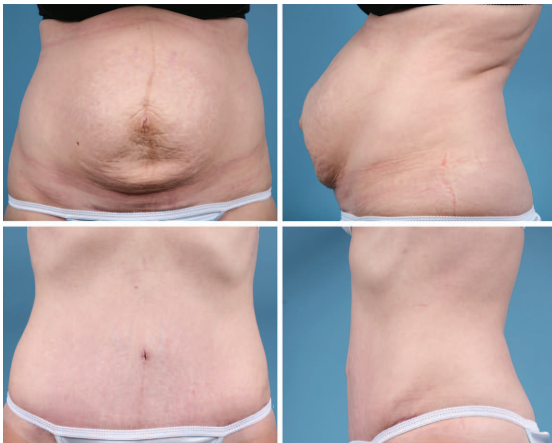
Fig. 5. Female patient with severe rectus diastasis undergoing retrorectus diastasis repair and a standard abdominoplasty incision.

The main reason that simple suture approximation of the rectus muscles may not provide a durable repair for both rectus diastasis and hernias is suture pull-through. Both running and interrupted sutures, when placed under tension, can cut through the anterior rectus fascia like a cheese wire cutter, leading to hernia recurrence and “stretching” of rectus diastasis procedures. However, the best aesthetic abdominoplasty procedure is probably the technique that achieves the highest tension. A high-tension tightening of the stomach muscles is achieved with mesh with this technique, rather than sutures alone, as is performed for the standard abdominoplasty. The mesh is quilted into place by numerous sutures placed in three vertically oriented lines. An increased number