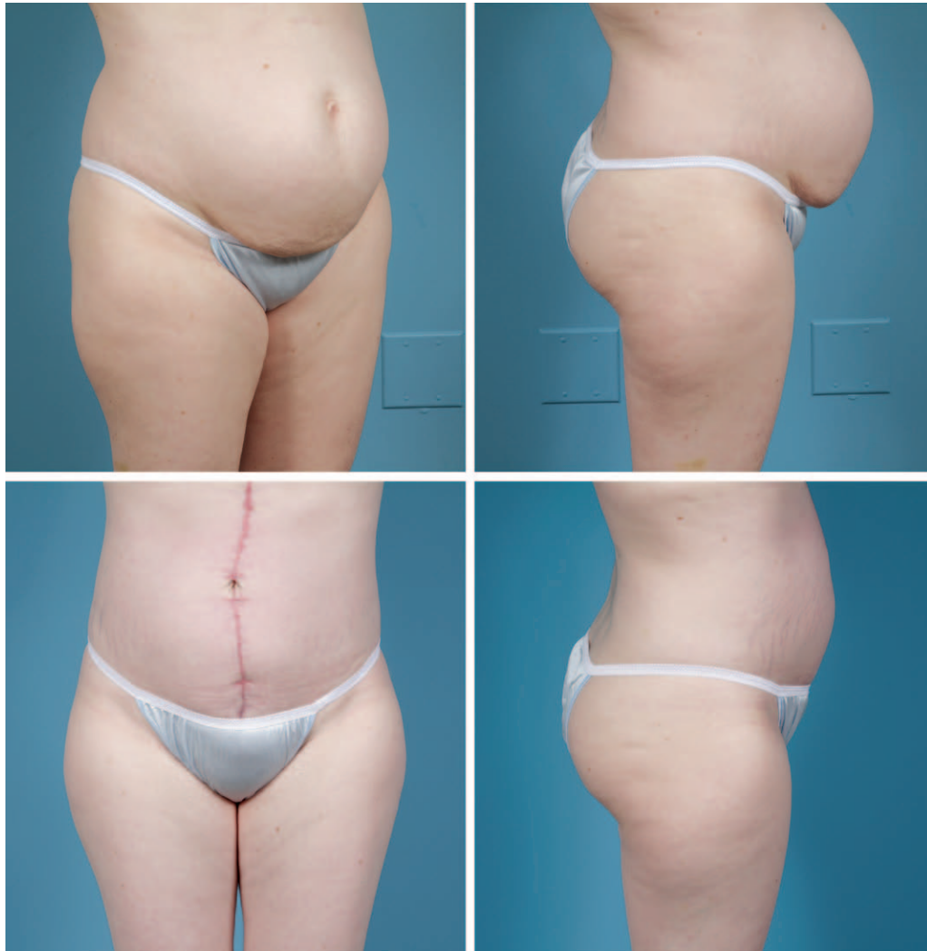
Fig. 4. Female patient with significant rectus diastasis undergoing retrorectus diastasis repair and vertical abdominoplasty with neoumbilicus formation.

because of comorbidities, and 3 were grade 3 because of potentially contaminated fields.