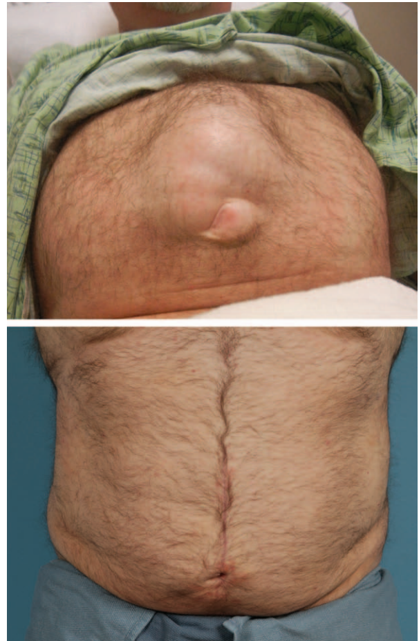
Fig. 1. (Above) The best physical examination for rectus diastasis is a reversed sit-up maneuver. (Below) This male rectus diastasis patient with umbilical hernia underwent a retrorectus mesh repair and skin tailoring through the vertical incision.

The condition of rectus diastasis is familiar but without standard definition. 10 Rectus diastasis, although not a true hernia, causes biomechanical alterations of the abdominal wall, leading to patient discomfort and an aesthetically displeasing torso. Increased intraabdominal pressure causes tissue expansion of the abdominal wall, particularly at the linea alba. Although certain conditions (such as genetic predisposition, aging, ascites, and chronic obstructive pulmonary disease) increase the risk of developing rectus diastasis, most women develop rectus diastasis after pregnancy, particularly those involving multiple gestations or sequential large infants. Female pattern rectus diastasis is centered at the level of the umbilicus, but can extend up to the xiphoid and down to the symphysis pubis. Male pattern rectus diastasis, in contrast, more frequently develops as a sequela of increased intraabdominal fat volume, occurs primarily supraumbilically, and occurs in the fifth to sixth decades of life (Fig. 1). 7 In addition, lateral insertion of the rectus muscles along the costal margin can contribute to both