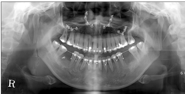
Fig. 2. Ten weeks after the orthognathic surgery, panoramic radiograph, showing discontinuity of proximal segment by radiolucent lesion.

graph and computed tomography (Fig. 2, 3) that demonstrates radiolucency and destructive bony change at the angle of right mandible with an evidence of sequestering bony segment. The patient was started on intravenous antibiotics (combination of 3rd generation cephalosporin and Metronidazole) upon admission, and she was taken to the operating room for removal of the sequestered bony segment and a drain placement. Intra-operatively, an approximately 15 mm sequestrum at the inferior aspect of the proximal segment was noted and removed. A three month post-operative panoramic radiograph (Fig. 4) was unremarkable, with resolution of symptoms.