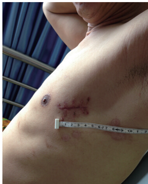
Figure 4 Postoperative examinations revealed satisfactory healing of the chest incision.

the inferior pulmonary vein was isolated and divided with 3-cm white stapler, sparing the superior tributary. Then, the basilar bronchus was divided with 4.5-cm green stapler. After inflating the residual superior segment of the lower lobe to demarcate the intersegmental plane, the basilar segment was divided along the plane, and removed in a specimen bag, sent for frozen section, which confirmed a benign lesion. Two chest tubes were routinely placed in the chest ( Figure 3 ). Operation time was 90 minutes, and operative blood loss 50 mL. After an uncomplicated recovery, the patient was discharged home 3 days after operation ( Figure 4 ).