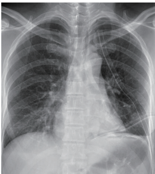
Figure 3 Chest X-ray examination showed the left lung was fully expanded and two chest tubes properly positioned.