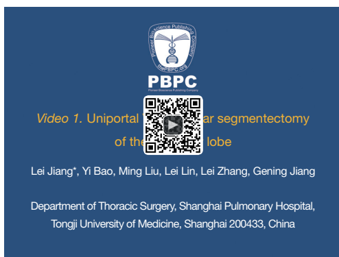
Figure 2 Uniportal VATS basilar segmentectomy of the left lower lobe (5). Available online: http://www.asvide.com/articles/400