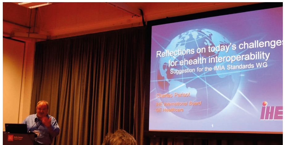
Fig. 6 Charles Parisot presenting reflections on today's challenges for ehealth interoperability