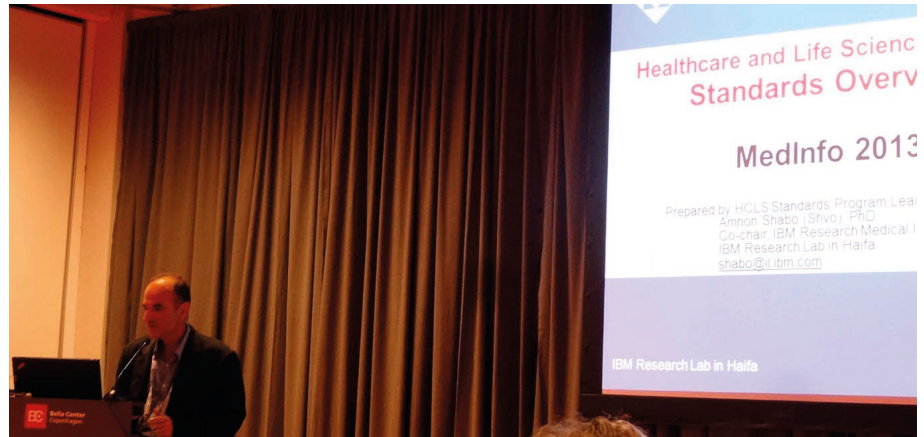
Fig. 4 Amnon Shabo presenting about HL7 activities