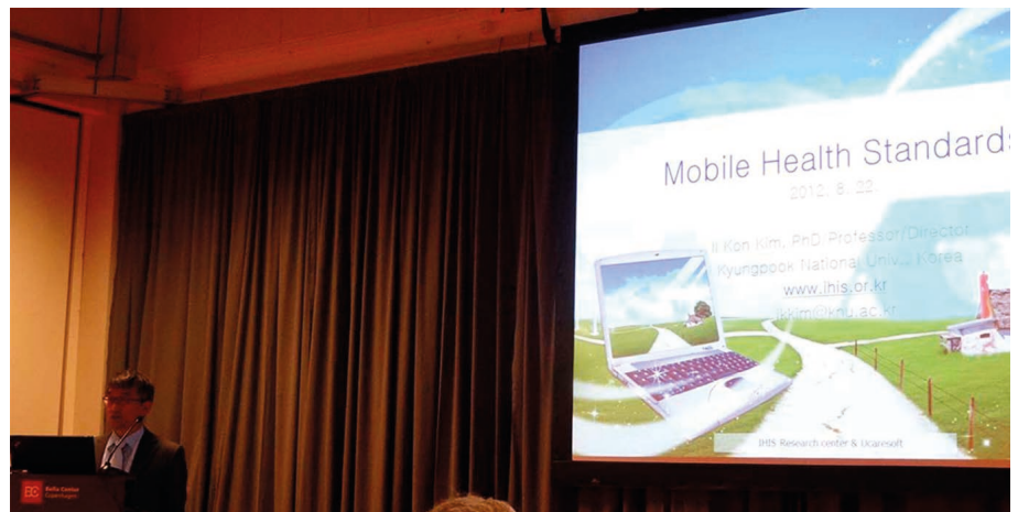
Fig. 5 Il Kon Kim presenting about the mobile health standards