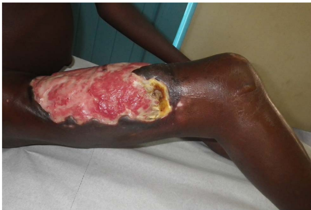
Fig. 3. A typical category III lesion of Buruli ulcer. Most Nigerian patients presented in medical center of Pobè in Benin with extensive ulcerative lesions. On the picture, the lesion of a Nigerian 10 years old child on the right thigh and with the typical characteristic of a late stage of the disease: large painless ulceration with presence of necrosis and undermined edges. doi:10.1371/journal.pntd.0003443.g003

river. These 3 draining systems discharge in separate lagoons that are interconnected by channels at the delta. Southeast Benin and Southwest Nigeria do not belong to the same drainage system, but these two Buruli ulcer endemic areas have a similar topography and climate, characterised by tropical rainforest, changeable topography with many small hills and fertile plains. Similar environments are encountered in other Buruli ulcer endemic areas of West Africa, for which the patients are found around different drainage systems but always with broad fertile richly inundated plains [17].