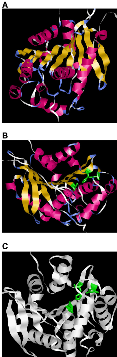
Fig. 4. Molecular modeling of the putative catalytic domain of bovine LIPE. (A) The three-dimensional (3D) model contains the 316–497 and 620–756 amino acid residues, showing eight \beta sheets connected by \alpha helices, which literally represent the core structural elements of the \alpha/\beta hydrolase fold catalytic domain. (B) The catalytic triad residues (depicted in green) are illustrated in sticks. (C) Alternate view of the catalytic triad with the enzyme depicted in green.