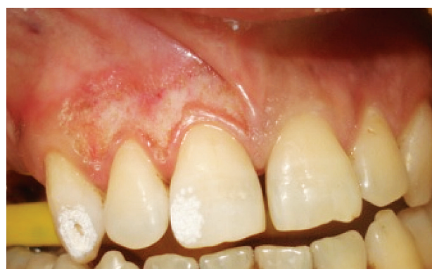
Figure 4. Conditioning by Er-Cr: YSGG laser