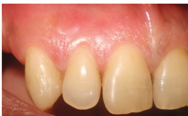
Figure 6. Follow up session after 4 weeks

after treatment but no pain was felt after day 1.