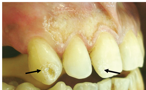
Figure 3. Caries removal by Er-Cr: YSGG laser