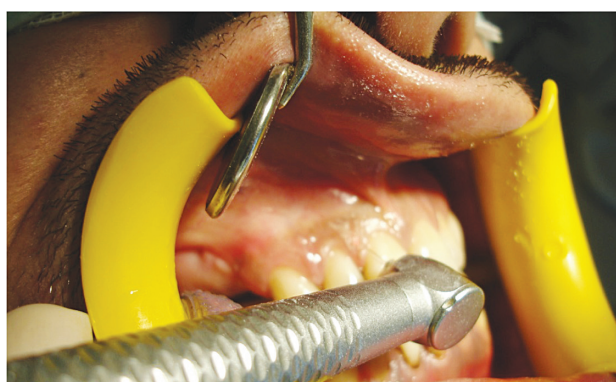
Figure 2. Depigmentation by Er-Cr: YSGG laser