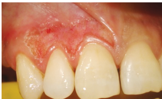
Figure 5. Composite restoration of teeth, gingival margin was preserved due to minimally invasive manner of laser surgery.