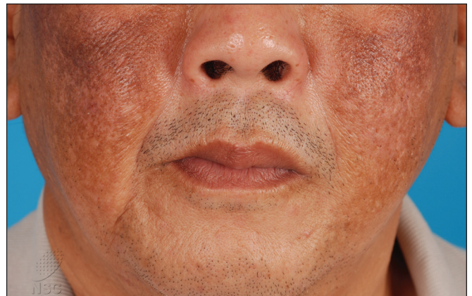
Fig. 1 Photograph shows the features of ochronosis observed in our patient: velvety, greyish-brown patches with coarse papulations; and scattered confetti-like hypopigmented macules secondary to chemical leucoderma.

Recently, Tan (7) described a case series of exogenous ochronosis in the Chinese population. In that study, Tan highlighted that the actual prevalence of the condition in the Chinese population was likely to be higher than that reported,