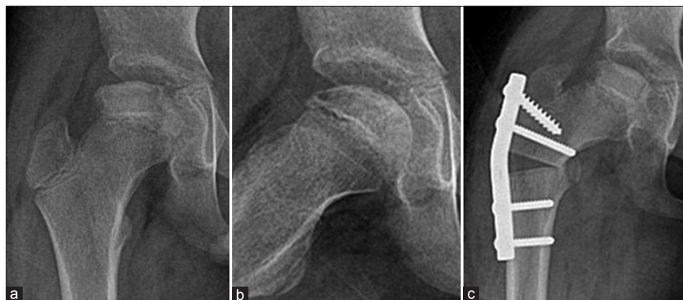
Figure 3: Anteroposterior (a) and frog leg lateral (b) radiographs of the hip of an 11-year-old boy with Perthes' disease in the early stage of the disease. An open wedge varus osteotomy with 20° of angulation has been performed (c)

Apart from containment (which is most widely practiced) some surgeons have attempted arthrodiastasis or joint distraction with an external fixator in an attempt to unload the hip and facilitate the restoration of epiphyseal height. 45,46 The reported results have not been sufficiently encouraging to recommend this as the procedure of choice. 46 Yet another