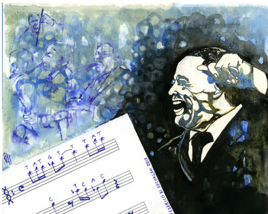
Figure 3: LncRNAs orchestrate the “diminuendo” and “crescendo” of cellular functions. Duke Ellington was probably the greatest conductor, composer and arranger in jazz history. His longtime friend and colleague Billy Strayhorn once said: “Ellington plays piano. But his real instrument is his orchestra. Each member of his orchestra is to him a distinctive tone color and set of emotions, which he mixes with others equally distinctive to produce a third thing which I like to call the Ellington Effect” [199]. One of Ellington’s most important compositions is “Diminuendo and Crescendo in Blue”: the title refers to expression marks that mean decreasing or increasing the sound in volume. The conductor controls the elements of musical expression (tempo, dynamics, articulation) as lncRNAs orchestrate and modulate gene expression and cellular functions.

Research over the last two decades has illuminated the complexity of the transcriptome and led to the detection of many lncRNAs. While it is still valid to assume that proteins are the effectors of cellular processes, new roles for RNA have begun to emerge; several lines of evidence indicate that lncRNAs play important roles in the control of gene expression and the maintenance of cellular functions. The balanced expression of these