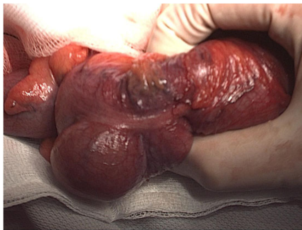
Dukes A Caecal cancer (confirmed on histopathology)

He was taken for laparotomy with the intention to perform an enterotomy to remove the gallstone and relieve the obstruction. On opening the abdomen, he was found to have a grossly dilated small bowel with a 3-cm gallstone which was freely mobile in the distal ileum. This was abutting a large caecal mass in keeping