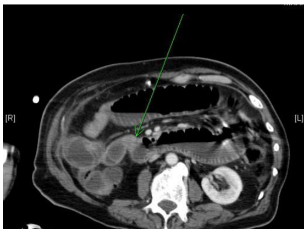
Gallstone causing Subacute SBO (Gallstone Ileus – ‘misnomer’)

Figure 1: Transverse section from abdominal CT showing pneumobilia.