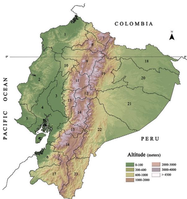
Fig. 2: map of Ecuador. The central brown Andes belt marks the Andean region. The Pacific coastal and eastern Amazon regions with tropical climate are in green. The yellow colour corresponds to the foothills of the mountains with subtropical climate. Cases of human paragonimiasis have been reported in all provinces except Galapagos Islands (not showed), Santa Elena (5), Carchi (7), Imbabura (8) and Tungurahua (12). The total country's area is 283,560 km 2 . According to 2010 census, there is a total population of 14,483,499 of which 7,236,822 live in the coastal region, 6,449,355 in the Andean, 739,814 in the Amazon and the rest in the Galapagos Islands (INEC 2010). 1: Esmeraldas; 2: Manabí; 3: Los Ríos; 4: Guayas; 6: El Oro; 9: Pichincha; 10: Santo Domingo de los Tsáchilas; 11: Cotopaxi; 13: Bolívar; 14: Chimborazo; 15: Cañar; 16: Azuay; 17: Loja; 18: Sucumbios; 19: Napo; 20: Orellana; 21: Pastaza; 22: Morona Santiago; 23: Zamora Chinchipe.

Life cycle - The parasite - Prior to 1971, it was believed that the infectious Paragonimus species in Ecuador was Paragonimus westermani (Rodríguez 1963).