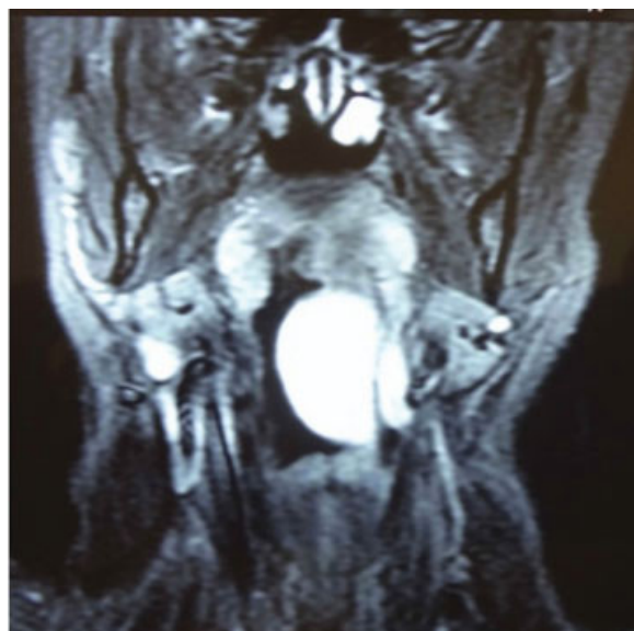
Fig. 3 Nuclear magnetic resonance, coronal view.