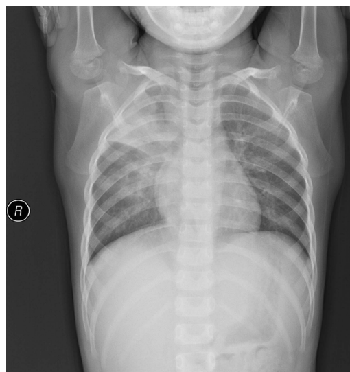
Figure 2 An example of right upper and middle lobe infiltration from a chest radiograph obtained 5 days after the onset of symptoms in a patient with mycoplasma pneumonia.