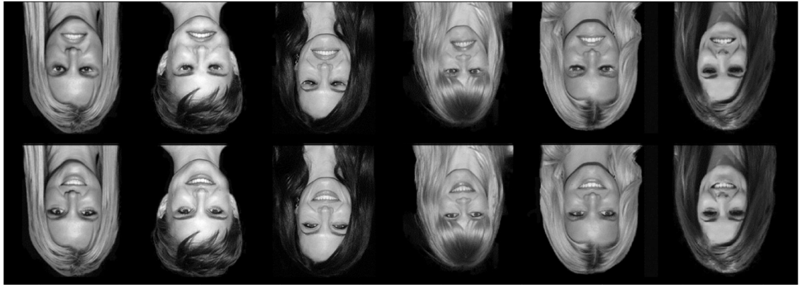
Fig. 1. The six identities used in the experiment. Identities were shown in both Thatcherized (top row) and normal (bottom row) configurations. Thatcherization consists of turning the eyes and the mouth upside down relative to the rest of the face. On each trial, stimuli were presented either in an inverted orientation (shown here) or in an upright orientation.