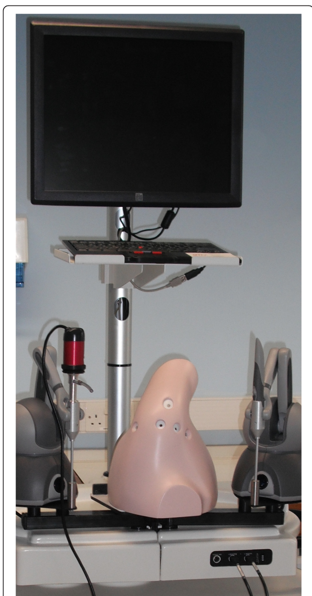
Figure 4 Virtual Reality arthroscopic simulator with haptic feedback. (Insight Arthro VR, Simbionics USA).

Shiralkar states that there is little difference between real and imagined experiences provided that the experience is imagined in a specific manner [51]. Evidence suggests that similar neural pathways are stimulated from imagined muscle movements as physical ones and therefore may be as effective as physical practice [52]. The application of this technique in surgical training is obvious. If proven to be effective, it would provide a low-cost, easily accessible tool that can be applied to multiple different procedures without the need for specialist equipment. The Association of Surgeons in Training (ASiT) in the United Kingdom has recognised the