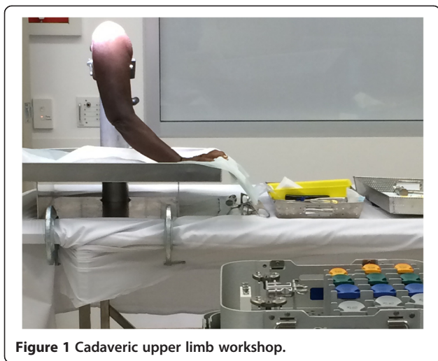
Figure 1 Cadaveric upper limb workshop.

fixation in isolation, without consideration of soft tissue anatomy, and therefore lacks realism.