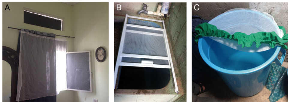
Figure 2. Curtains in windows, rectangular container cover and circular container cover. The Figure shows three intervention tools. (A) a curtain inside a household in Girardot. (B) the rectangular water container cover for rectangular or square cement containers of at least 200 L capacity; the cover is made of an aluminum frame, LLIN netting and a sliding mechanism for opening both doors. (C) the circular cover made of rubric, LLIN netting and rubber, for plastic and cement cylindrical containers that can store more than 200 L. This figure is available in black and white in print and in colour at Transactions online.