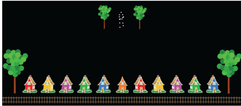
Figure 1. Example of a point-light walker (with a -18^\circ heading) and response options. For display purposes, the dimensions of the stimuli are close to but do not exactly match the dimensions from the actual experiment.